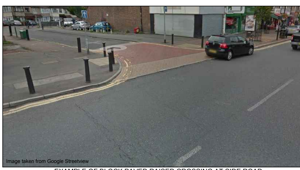
EXAMPLE OF BLOCK PAVED RAISED CROSSING AT SIDE ROAD