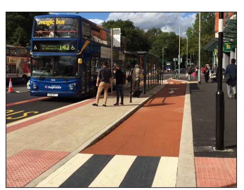
EXAMPLE OF FLOATING BUS STOP