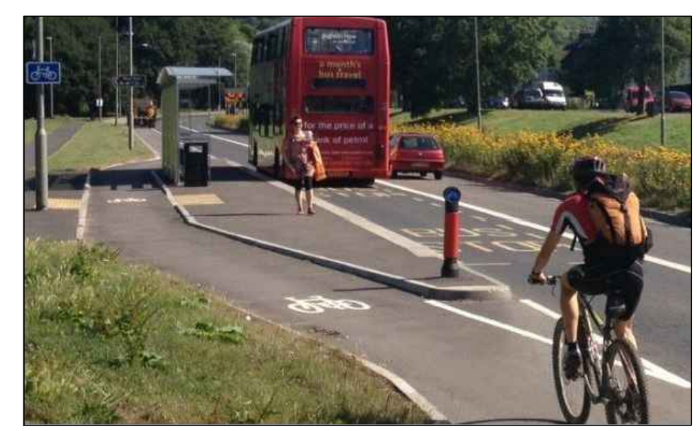
EXAMPLE OF FLOATING BUS STOP